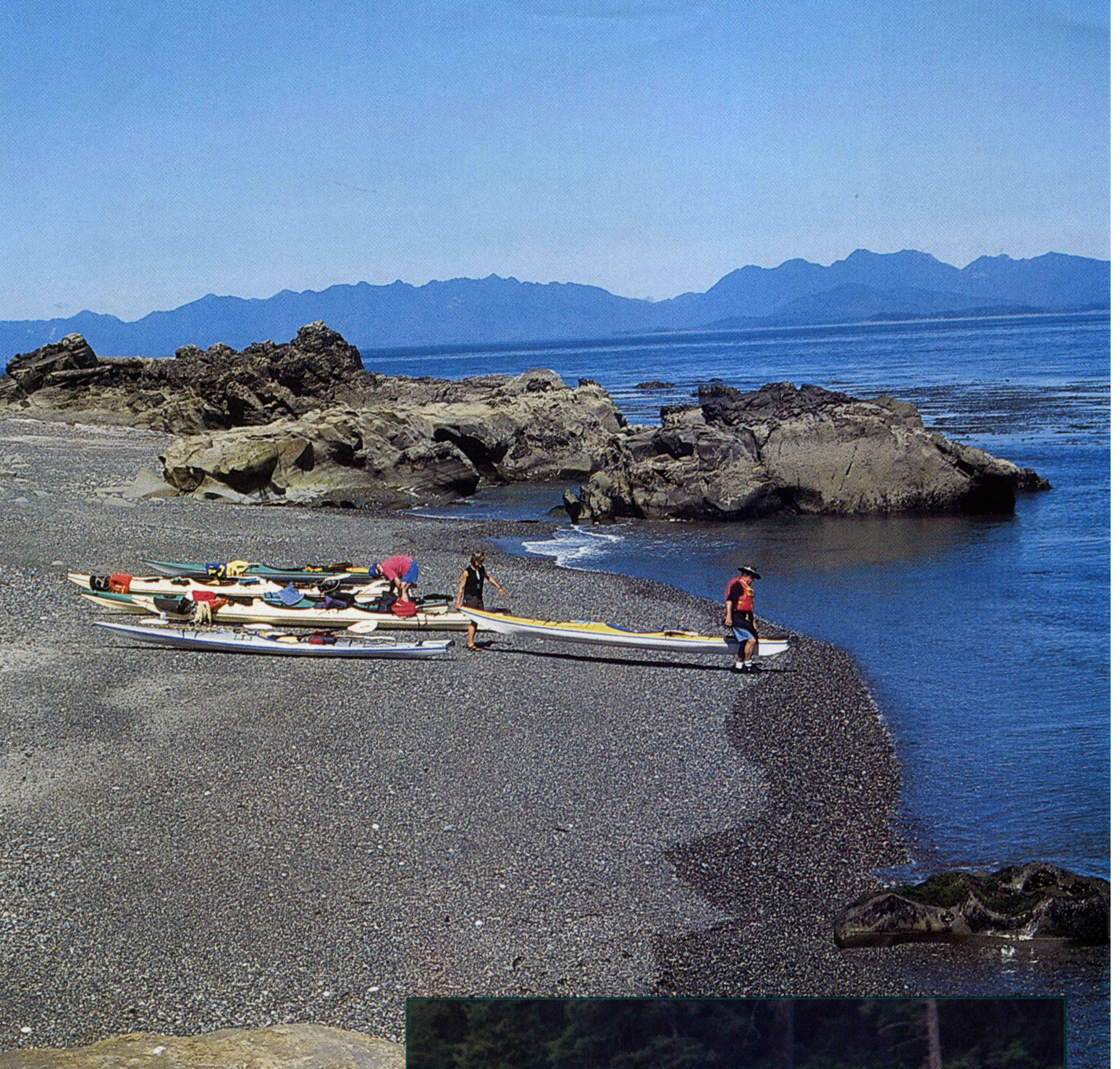
Top: Launching from Lookout Island on the outer edge of the Mission Group, south of Kyuquot.