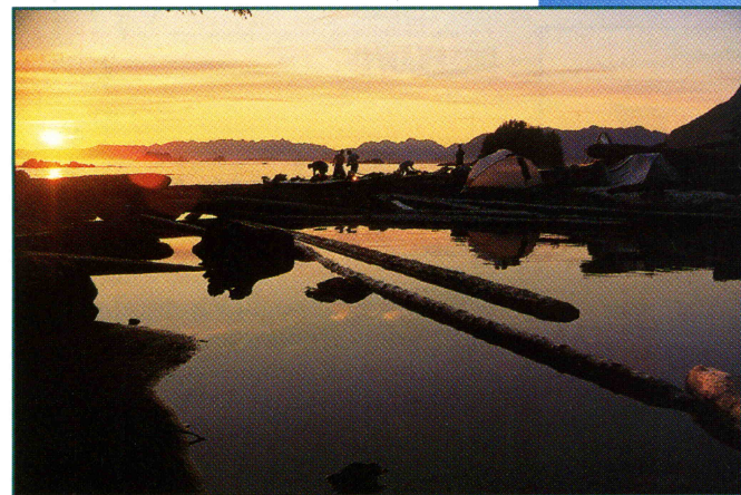
A challenging day ends with serene views towards the Brooks Peninsula from a campsite on the eastern shore of Checleset Bay.