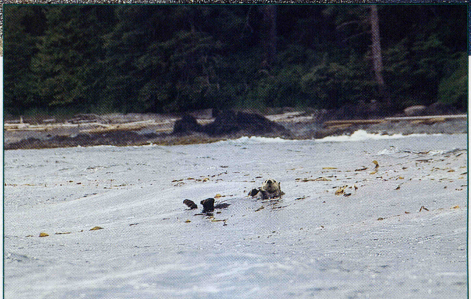
Right: Sea otters, almost driven to extinction by over-hunting, are now protected within the Checleset Bay Marine Ecological Reserve.